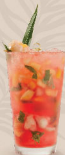
熱情桑格利亞 tropical sangria $58