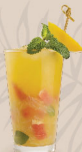
芒果柚子特飲 mango cha cha $58