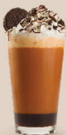
朱古力奶茶 choco cha cha $48